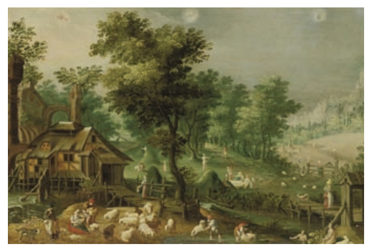
Abel Grimmer, An Allegory of Summer with Three Signs of the Zodiac: A Wooded Landscape with Peasants Shearing Sheep and Harvesting Corn, Private Collection (Figure 5)

Grimmer was the son of his painter father, Jacob (1525/6-before 1590) whom the art historian Giorgio Vasari (1511-1574) considered one of