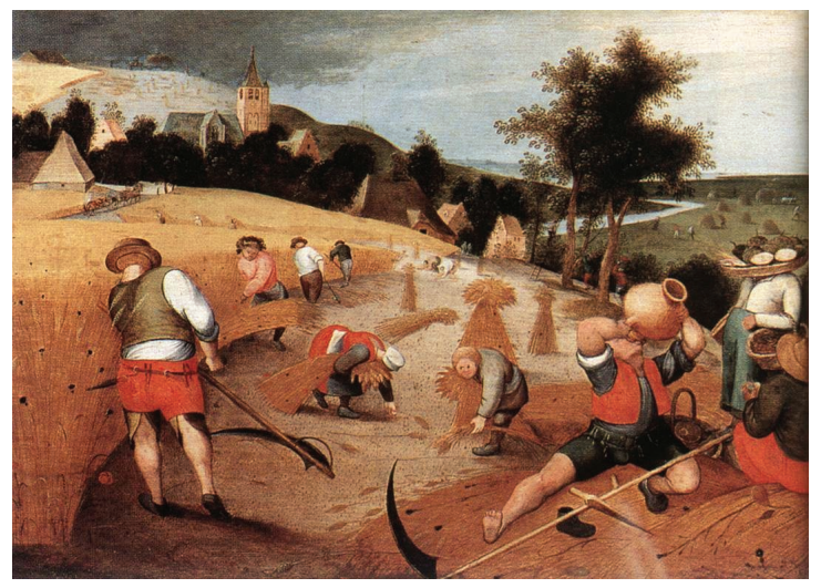
Abel Grimmer, Summer, 1607, Koninklijk Museum, Antwerp (Figure 2)

In the composition of An Allegory of Summer , Abel Grimmer creates an almost pictorial narrative aided by a subtle yet highly effective use of light and shade. In the left foreground, a shepherd dressed in a loose red tunic and virtually obscured by the shade of a tall oak idly tends his flock as they amble unhurriedly down the brilliantly sun-lit path. Three sheep pause at the bottom leading the eye at once to the relaxed picnic of the tired labourers. The stooks and the precise line resulting from the harvesters' toil lead the eye further back into the recesses of the composition, to the horse-drawn cart and a cluster of paler silhouettes of the same foreground stooks. Two farmsteads stand at the edge of the field, while beyond, blue-green woods line the horizon. In the very far distance a shimmering church spire can be seen, the creamy clouds tinged with pink vividly conjuring up the reality of the searing heat and windlessness of a perfect summer's day.