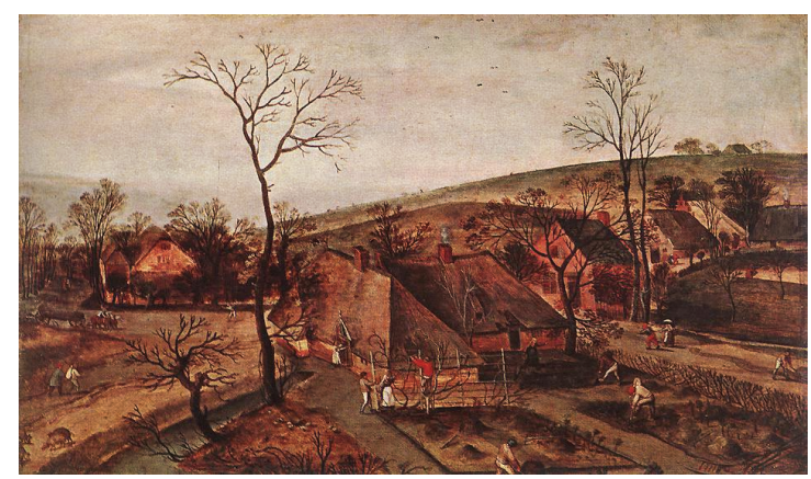
Jacob Grimmer, Spring, Museum of Fine Arts, Budapest (Figure 6)

Born in 1570, Grimmer became a master in the Antwerp Guild of St. Luke in 1592. His paintings owe much to his father's style as well as to Brueghel the Elder, as discussed above. Grimmer often copied prints engraved by Pieter van der Heyden (c.1530-1572) after designs by Brueghel and the artist Hans Bol (1534-1593).<sup>6</sup> His series of the Twelve Months (1592, Montfaucon-en-Velay, Haute-Loire, Chapelle Nôtre-Dame), for instance, are exact copies of Adriaen Collaert's prints after Bol.<sup>7</sup> While he also painted church interiors and other architecturally inspired pieces, Grimmer is perhaps best known for his depictions of peasants at work or leisure in the outdoors as in An Allegory of Summer .