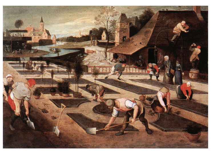
Abel Grimmer, Spring, 1607, Koninklijk Museum, Antwerp (Figure 1)

EEKING SHADE FROM THE FIERCE SUMMER SUN, A group of harvesters recline under the boughs of a tree sharing a simple meal of bread and cheese. The whole scene bustles with activity as a number of labourers still toil in the field beyond, gathering the carefully scythed corn into neat stooks. Men, women and children all lend a hand giving a sense of dynamic community to the work. A little child dressed in a white smock can be seen wrestling with a bundle of corn far too big for her to manage. Another young child sits in the shade, his back to the viewer as he thirstily drinks from the bowl of milk that has been set upon a spotless, white table cloth. In bare feet a man and a woman frame the activity of the harvesters' merry picnic; the woman bending forward to eat while the man leans back to drain a flagon of ale. With their hats and scythes cast aside for the brief respite provided by their meal, this group stands in contrast to the hard work still going on behind them. A little dog mischievously sniffs the picnic basket next to his unsuspecting owners, who are oblivious to everything except resting their weary limbs and sating their hunger. This imbues the ritual of the harvest with a sense of light hearted realism.