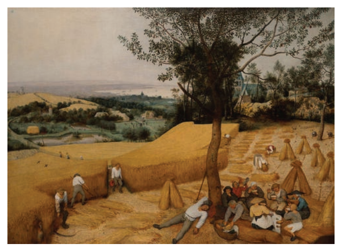
Pieter Brueghel the Elder, The Harvesters , 1565, The Metropolitan Museum of Art, New York (Figure 4)

as a couple gathers wheat into bundles, three men cut stalks with scythes, and several women make their way through the wheat field with stacks of grain over their shoulders. The vast panorama across the rest of the composition reveals that Brueghel's emphasis is not on the labours that mark the time of the year, but on the atmosphere and transformation of the landscape itself.